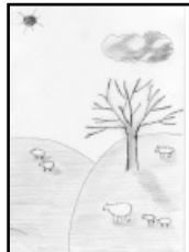
This month's cover picture is by Kolby Lymer